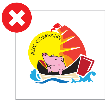
Never lay anything on the design.