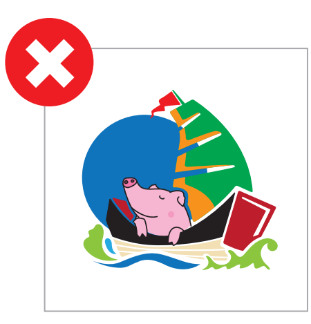
Never change any color in full color mode