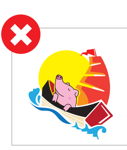
Never use rotate the design.