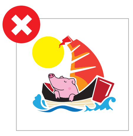
Never change the position and size of any element in the design.