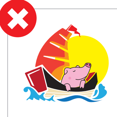
Never reverse the the design.